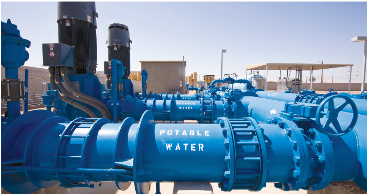
Oasis Water Treatment Plant

The following tables show regulated substances that were required to be tested and were detected in Glendale drinking water in 2021. The tables contain the name of each substance detected, the highest level allowed by regulation, the ideal goals for public health, the amount detected and the usual sources of such contamination. Certain contaminants are required to be monitored less than one time per year because concentrations of those contaminants are not expected to vary significantly from year to year. For those contaminants that were not required to be tested in 2021, this report includes data from the most recent required testing. The presence of contaminants does not indicate that the water poses a health threat, only that they were detected during routine compliance monitoring. Glendale monitored for more substances which were not detected.