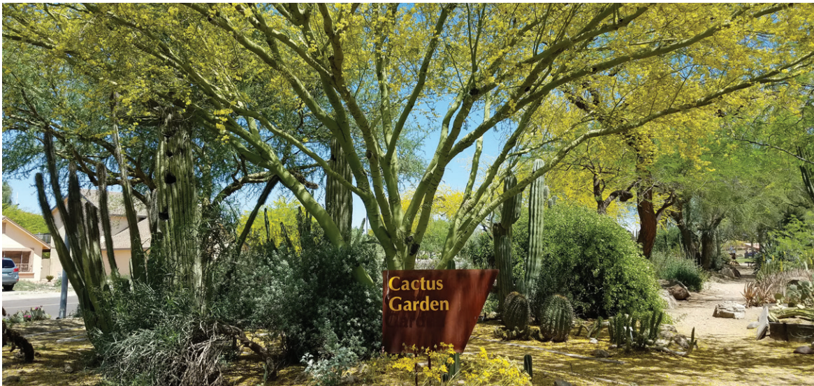
Glendale Xeriscape Demonstration Garden

The Southwestern United States, including Arizona, has been in a drought for more than 22 years. This has greatly impacted the Colorado River system including Lake Mead and Lake Powell. The Colorado River represents approximately 36% of Arizona's collective water supply. Considering Arizona's priority system, the city of Glendale's Colorado River supply will not be reduced in the immediate future. In other words, a water shortage on the Colorado River does not mean a water shortage at your tap.